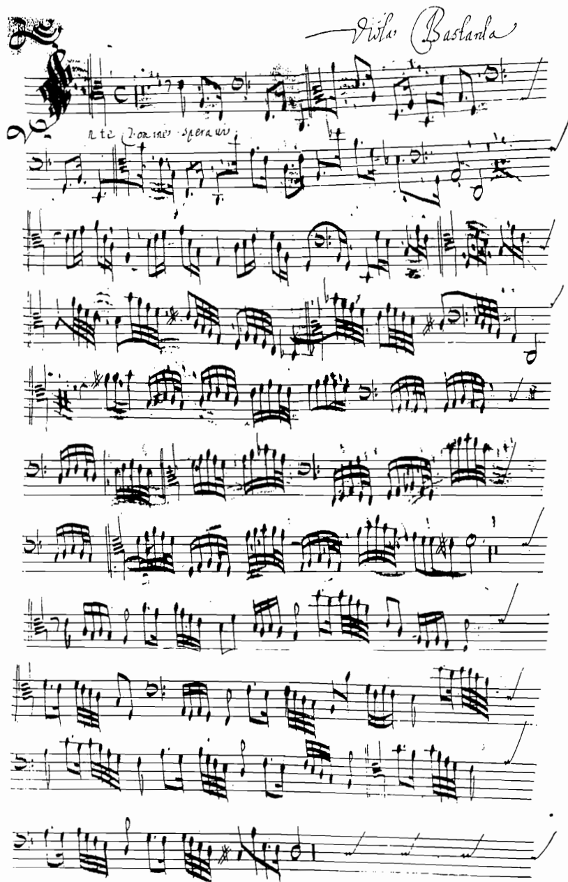
Plate 1. Giovanni Valentini, “In te Domine speravi,” D-Kl, 2 o Ms. mus. 51 o , first page of the viola bastarda part

now preserved at Kassel (see Plate 1), among them a setting of “Delectare in Domino” by the imperial organist Wolfgang Ebner (Ms. mus. 2 o 53 m ), and Valentini’s “Vesperae Integrae de Dominica” (Ms. mus. 2 o 51 n ). 11