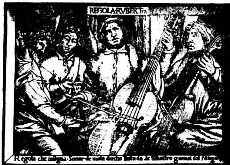
Figure 2. Silvestro di Ganassi, Regola Rubertina , title-page woodcut (1542)

What is so striking about the illustrations we can find of sixteenth-century consorts, such as those listed by Ian Woodfield, 11 is not so much the large dimensions of the bass, but rather the absence of what we would now recognize as a treble. (The difference in size between a tenor and a bass is sometimes subtle enough that one can easily miss it—as I believe Woodfield has, for instance, in no. iii of his list; here he sees instruments of two sizes, tenor and bass, whereas I see three. Similarly, he interprets the group depicted in no. i of his list—the title-page woodcut of Ganassi's Regola rubertina [see Figure 2]—as a large tenor and two basses, while I would take it instead as a bass and two tenors. 12 Identifying the size of viols in sixteenth-century representations is further