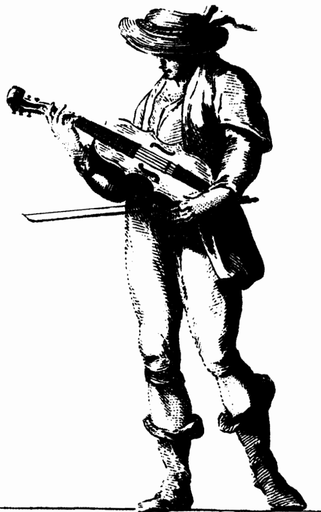
Pardessus de Viole à 5 Cordes.