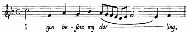
Example 9. Thomas Morley

their text setting, but these classical principles may be observed in the vocal works of William Byrd and Thomas Morley. 24 In the following example, the opening of a canzonet from Morley's The First Booke of Canzonets to Two Voyces (1595), the long tones and leaps are set each note to a syllable, while the quicker stepwise notes following are melismatic, a procedure used throughout this work. This procedure is consonant with the principles of viol bowing discussed above. In the fantasies for two viols which Morley included with the canzonets, many points of imitation are structured in this same way, but of course there are no slurs because it was not customary for a composer to mark them. The patterns used by Morley in the vocal settings may serve as a model for bowing in the fantasies, with the difference that the melismas are often too long for a bow stroke, so the violist will need to take more strokes. An application of these principles to a fantasy for viols, with the slurs marked by the composer, can be observed in the example by Matthew Locke, quoted above.