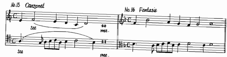
Example 10. Thomas Morley

A second example illustrates a favorite cadence formula, used by Morley in the vocal canzonets and the instrumental fantasies alike. In the vocal settings, this cadence formula is invariably melismatic, a clear indication of how the composer intended it to be performed.