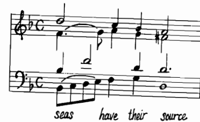
Example 11. John Dowland

A few more examples may illustrate appropriate adaptations of vocal melismas to instrumental performance. The song in four parts by John Dowland, "The lowest trees have tops," from The Third and Last Booke of Songs or Aires (1603), was intended to be sung, played on viols, or sung and played. It would be appropriate for viol players to follow the vocal slurs. The quiet dignity of movement in this lovely song would be disturbed by a series of short separate strokes. Similar patterns of slurring may be found in the fantasies of John Jenkins, a composer of the next generation, marked by the composer.