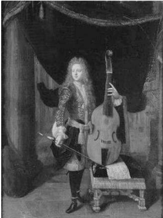
Figure 1. The painting of Marin Marais by Jean Dieu dit Saint-Jean.